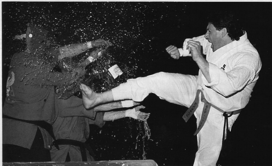
A 1993 martial-arts demonstration in which Dux uses one kick to smash two bottles of champagne held by his students.

world of the movies) the Agency has other, more bureaucratic and less dramatic ways of dealing with unsatisfactory employees.