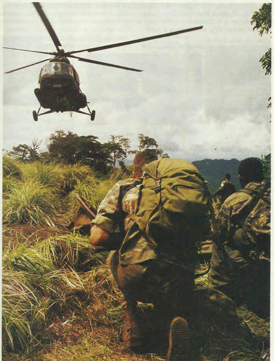
Air-Sniping In Sierra Leone — page 42