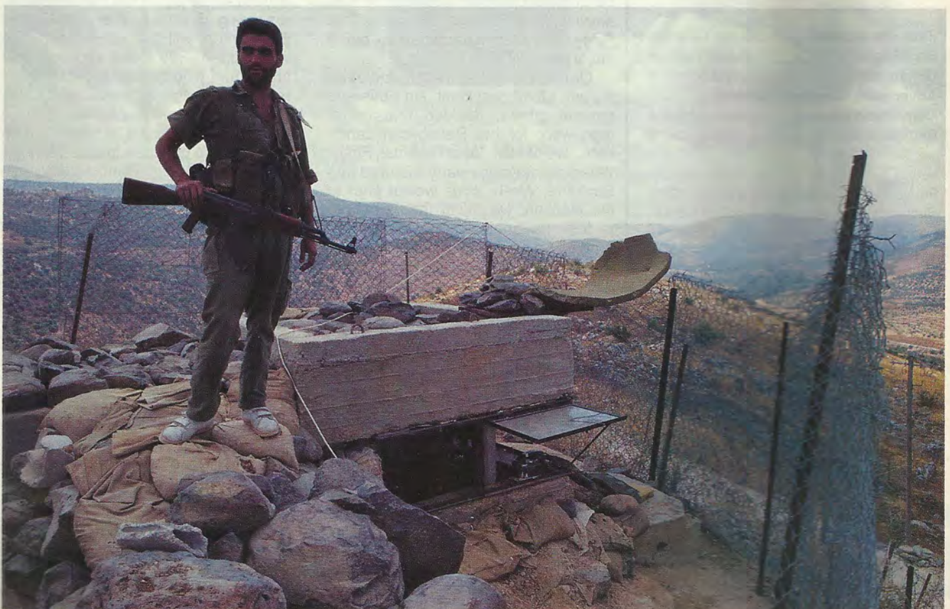
Katyushas For The Koran — page 32

To interdict NVA movement on some parts of the Ho Chi Minh Trail, the high-tech U.S. Air Force reluctantly went low and slow with